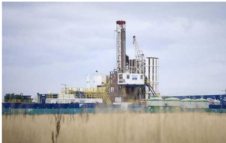
Fracking rig in Lancashire, 2011